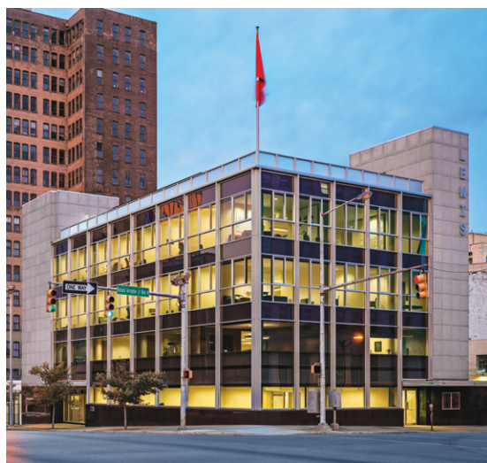
Lewis Communications, Birmingham, AL Architect: Williams Blackstock Architects