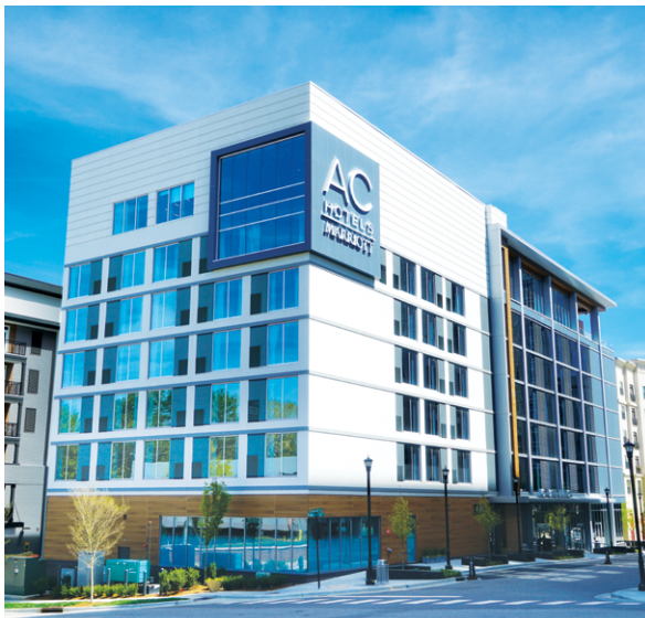
AC Hotel By Marriott, Raleigh, NC Architect: DRL Group

The Reliance™ Window Wall from Oldcastle BuildingEnvelope® is a factory assembled, sealed and glazed window wall product offering both Captured and Non-Captured options with a variety of 1" infill options. This screw spline assembly has square cut components to reduce fabrication and utilizes 3M's™ structural glazing tape in lieu of silicone to reduce glazing labor. The Reliance™ Window Wall design has reinforced polyamide thermal struts integrated into the head/sill cans to provide exceptional thermal performance. One of the most outstanding benefits of Reliance™ Window Wall is the assembly and glazing of the window wall frames under factory controlled conditions. This reduces field labor and minimizes on site applied seals. The system is also designed to be installed from inside the building which is an easier installation and eliminates the need for staging equipment during unit installation.