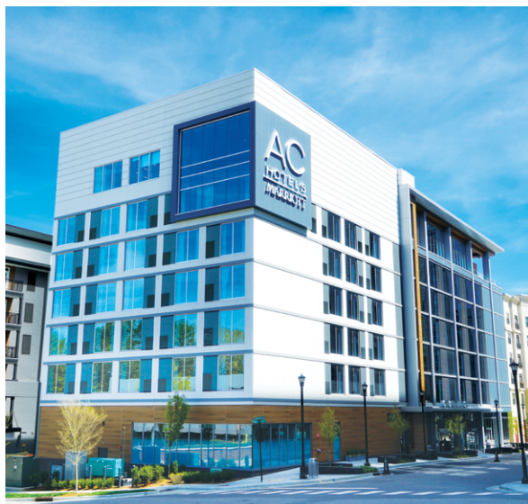
AC Hotel By Marriott, Raleigh, NC Architect: DRL Group

The Reliance™ Window Wall from Oldcastle BuildingEnvelope® is a factory assembled, sealed and glazed window wall product offering both Captured and Non-Captured options with a variety of 1" infill options. This screw spline assembly has square cut components to reduce fabrication and utilizes 3M's™ structural glazing tape in lieu of silicone to reduce glazing labor. The Reliance™ Window Wall design has reinforced polyamide thermal struts integrated into the head/sill cans to provide exceptional thermal performance. One of the most outstanding benefits of Reliance™ Window Wall is the assembly and glazing of the window wall frames under factory controlled conditions. This reduces field labor and minimizes on site applied seals. The system is also designed to be installed from inside the building which is an easier installation and eliminates the need for staging equipment during unit installation.