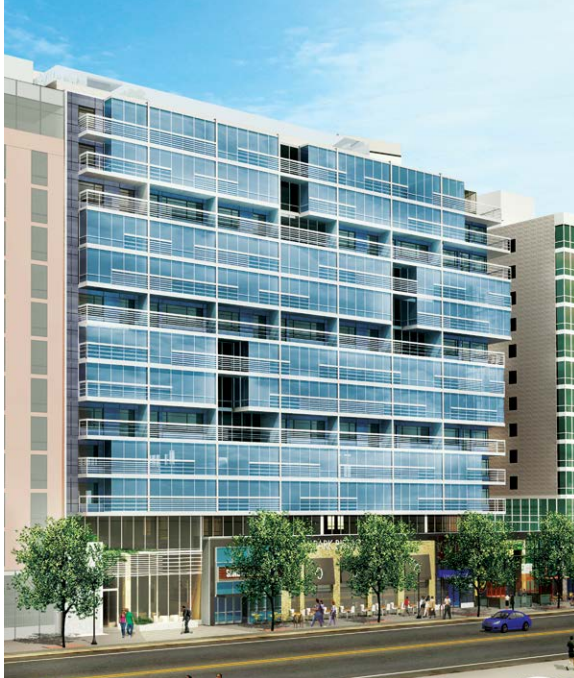
701 Ballpark Square Location: Washington, D.C. Architect: Hickok Cole Architects